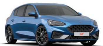
Ford Performance Blue