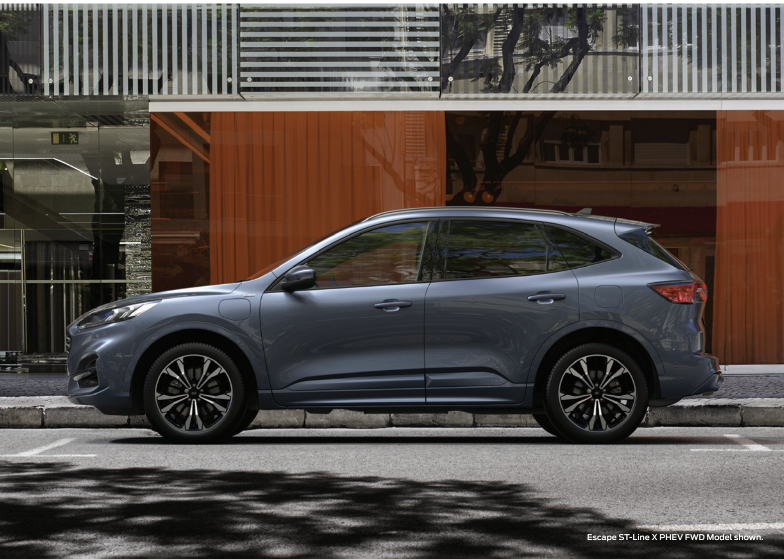
Escape ST-Line X PHEV FWD Model shown.