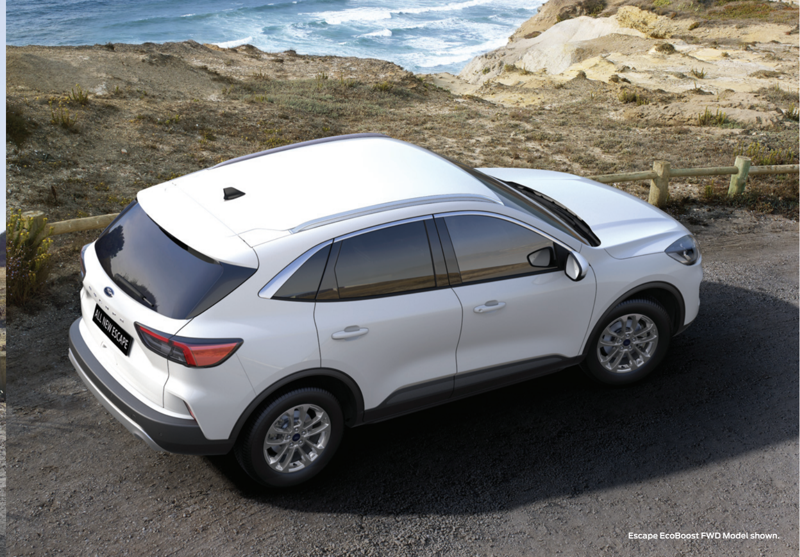
Escape EcoBoost FWD Model shown.