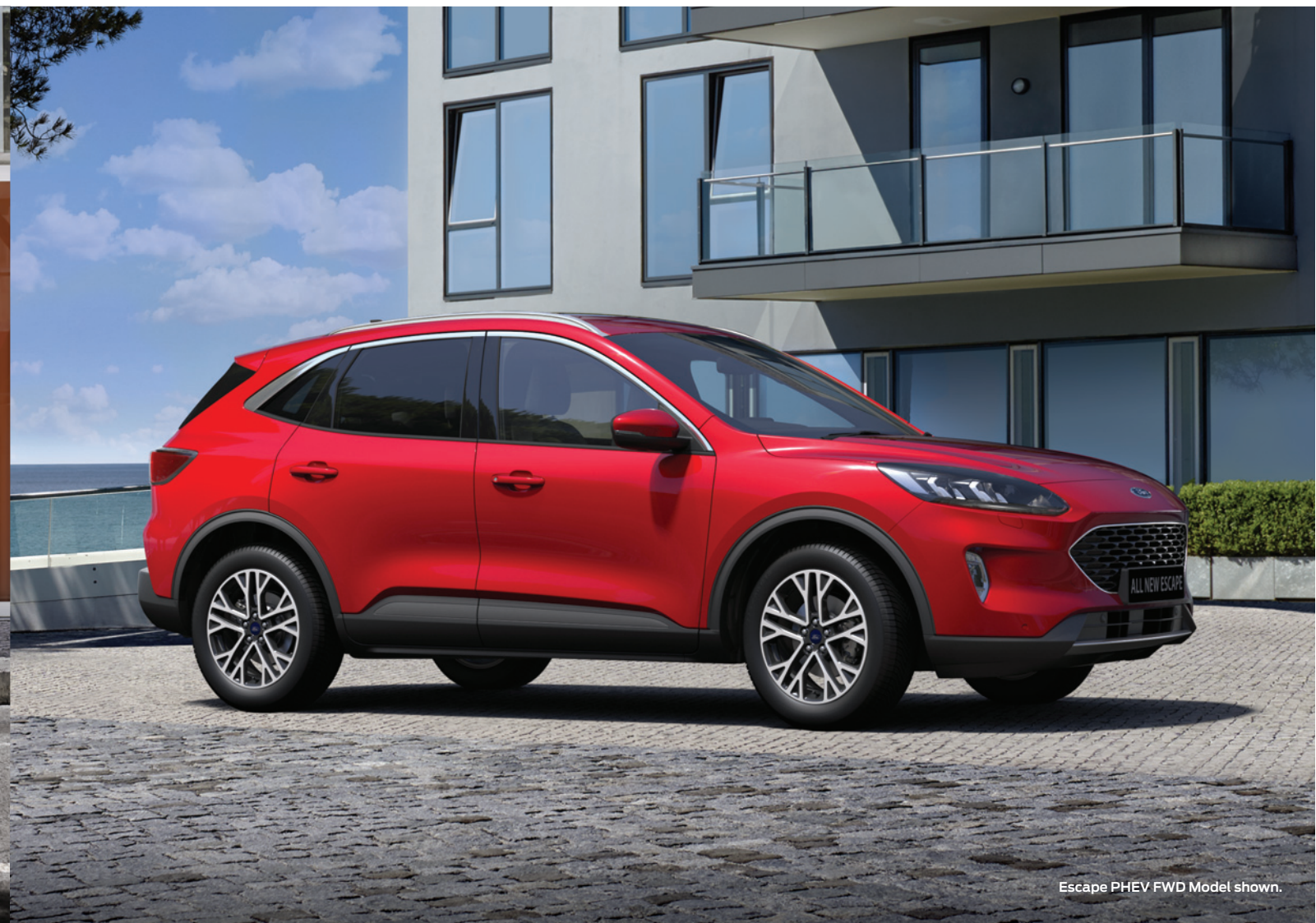
Escape PHEV FWD Model shown.