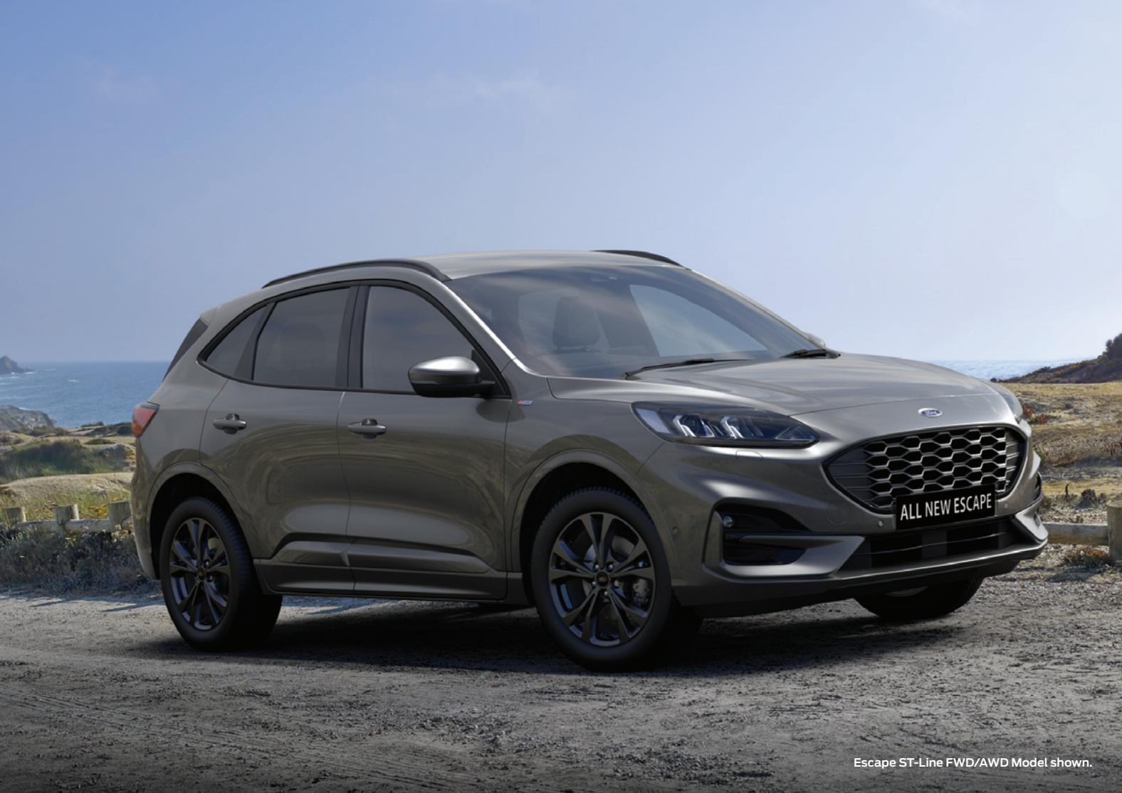
Escape ST-Line FWD/AWD Model shown.