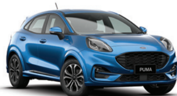
Desert Island Blue