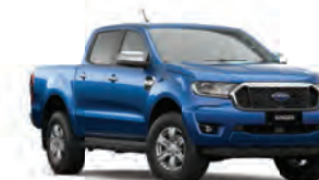
XLT in Blue Lightning ^