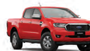
XLT in True Red †