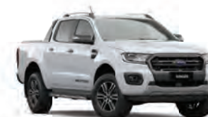
Wildtrak in Arctic White

* Wildtrak exclusive colour † Not available on Wildtrak ^ Not available on FX4