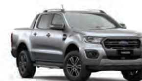
Wildtrak in Aluminium Silver