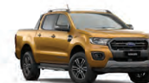
Wildtrak in Saber *