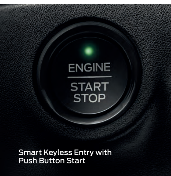
Smart Keyless Entry with Push Button Start