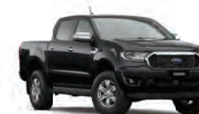
XLT in Shadow Black