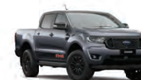
FX4 in Meteor Grey